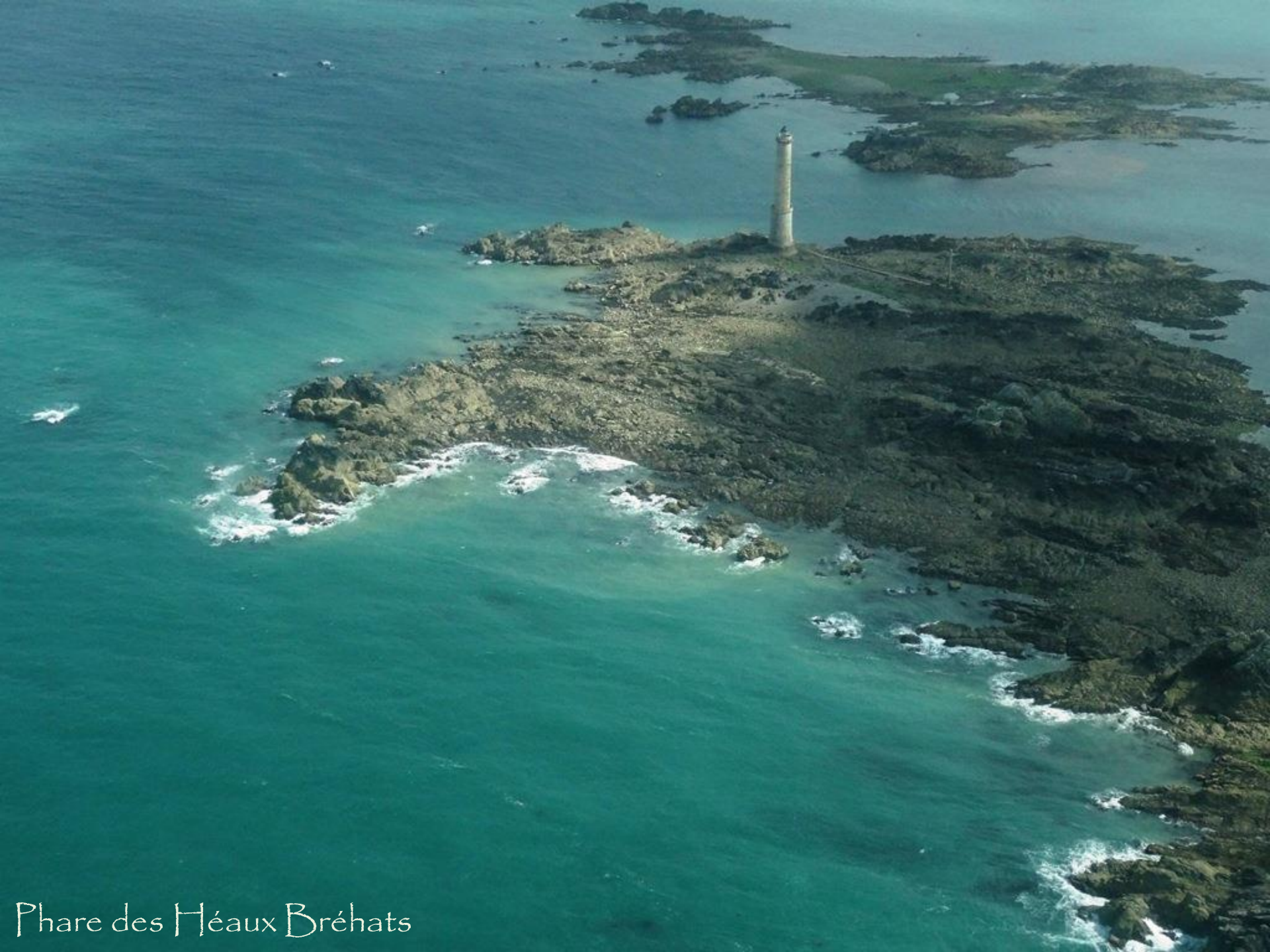
Phare des Héaux Bréhats