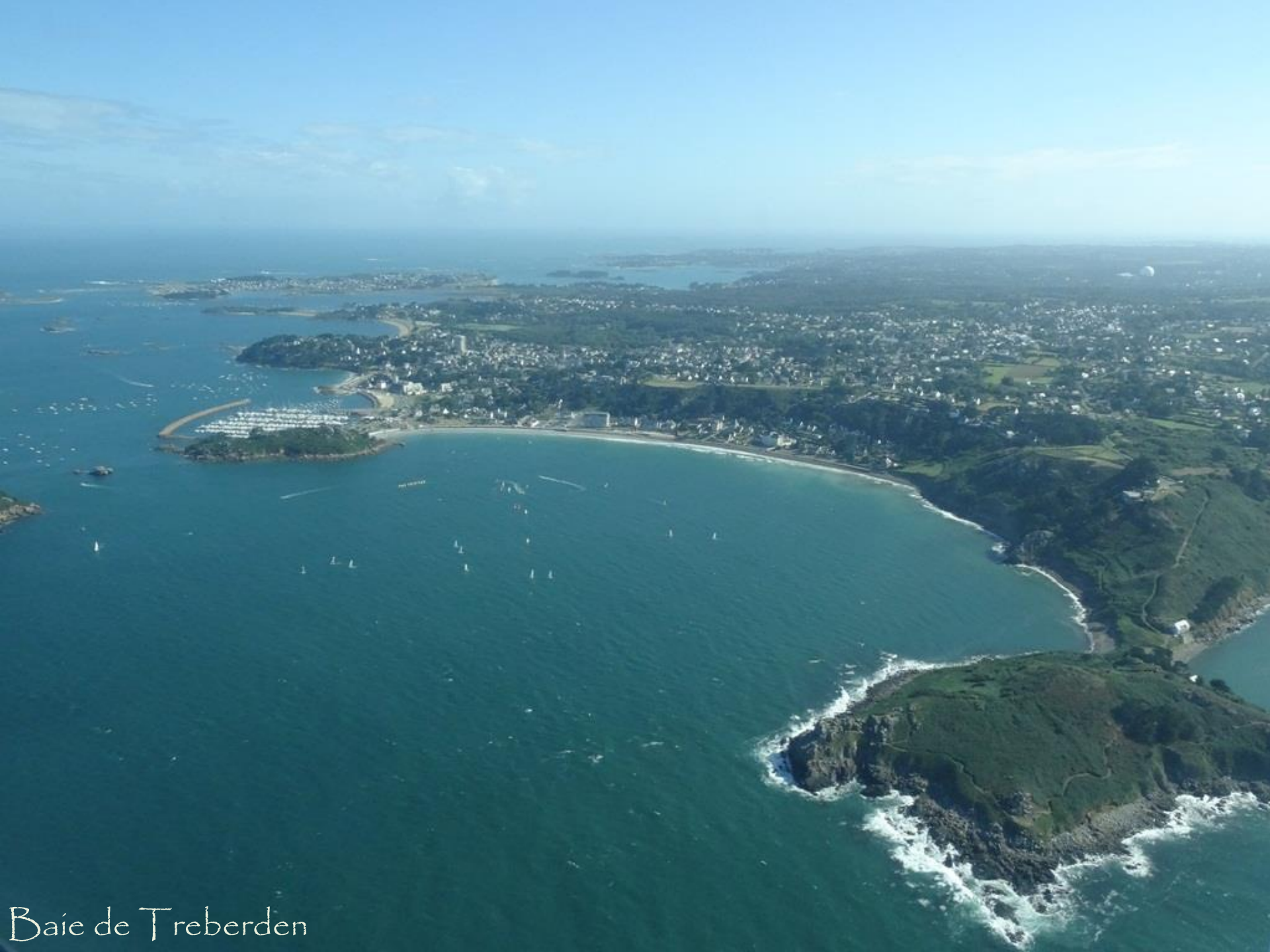
Baie de Treberden