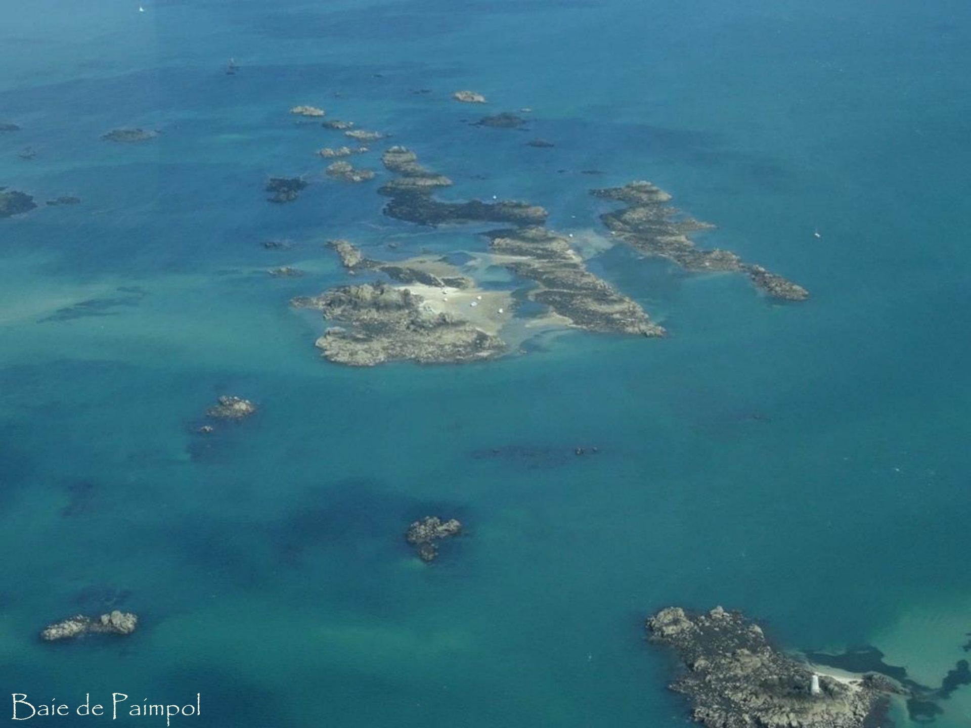
Baía de Paímpol