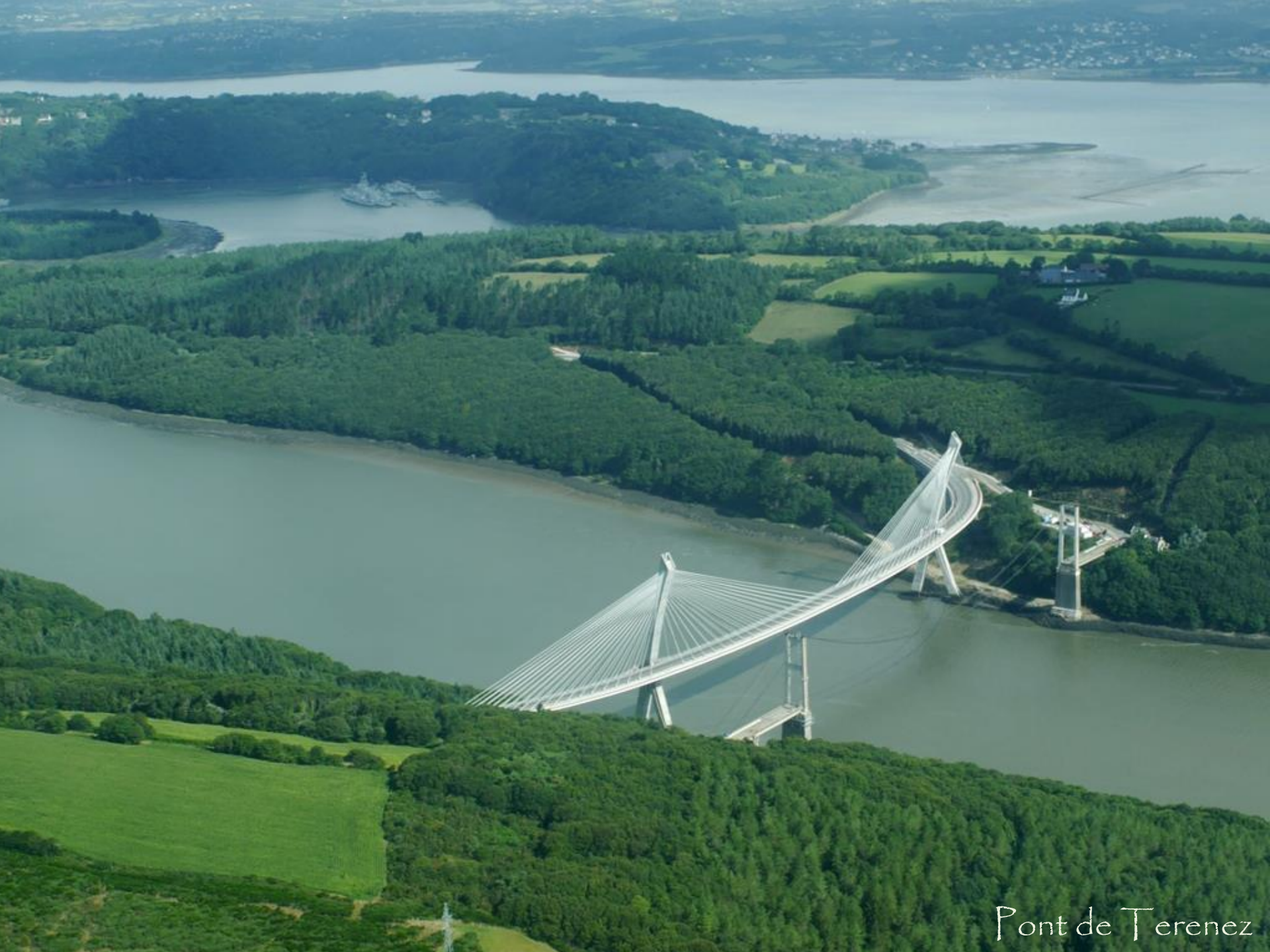
Pont de Terenez