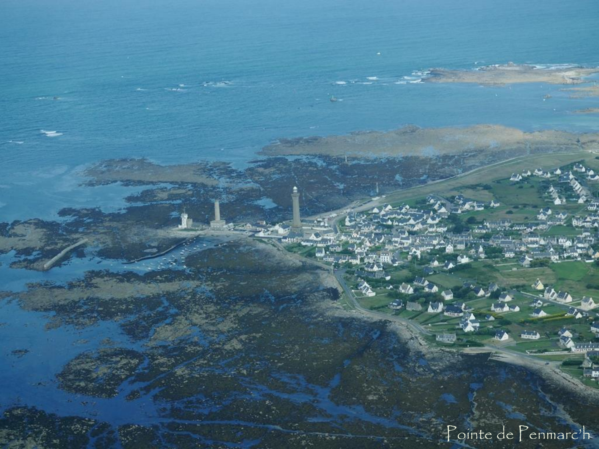
Pointe de Penmarc'h