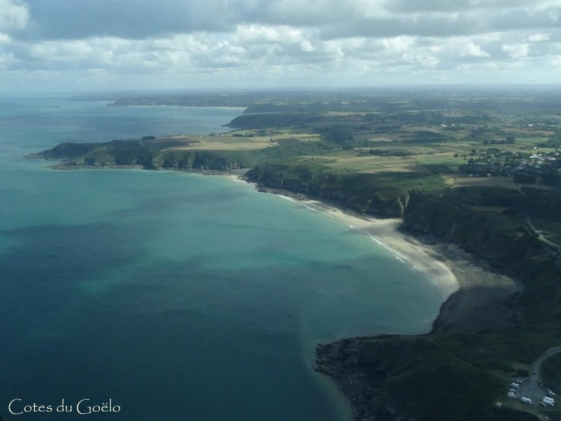
Cotes du Goëlo