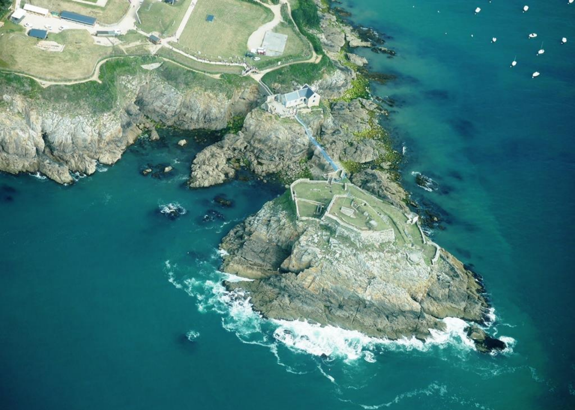
Fort de Bertheaume