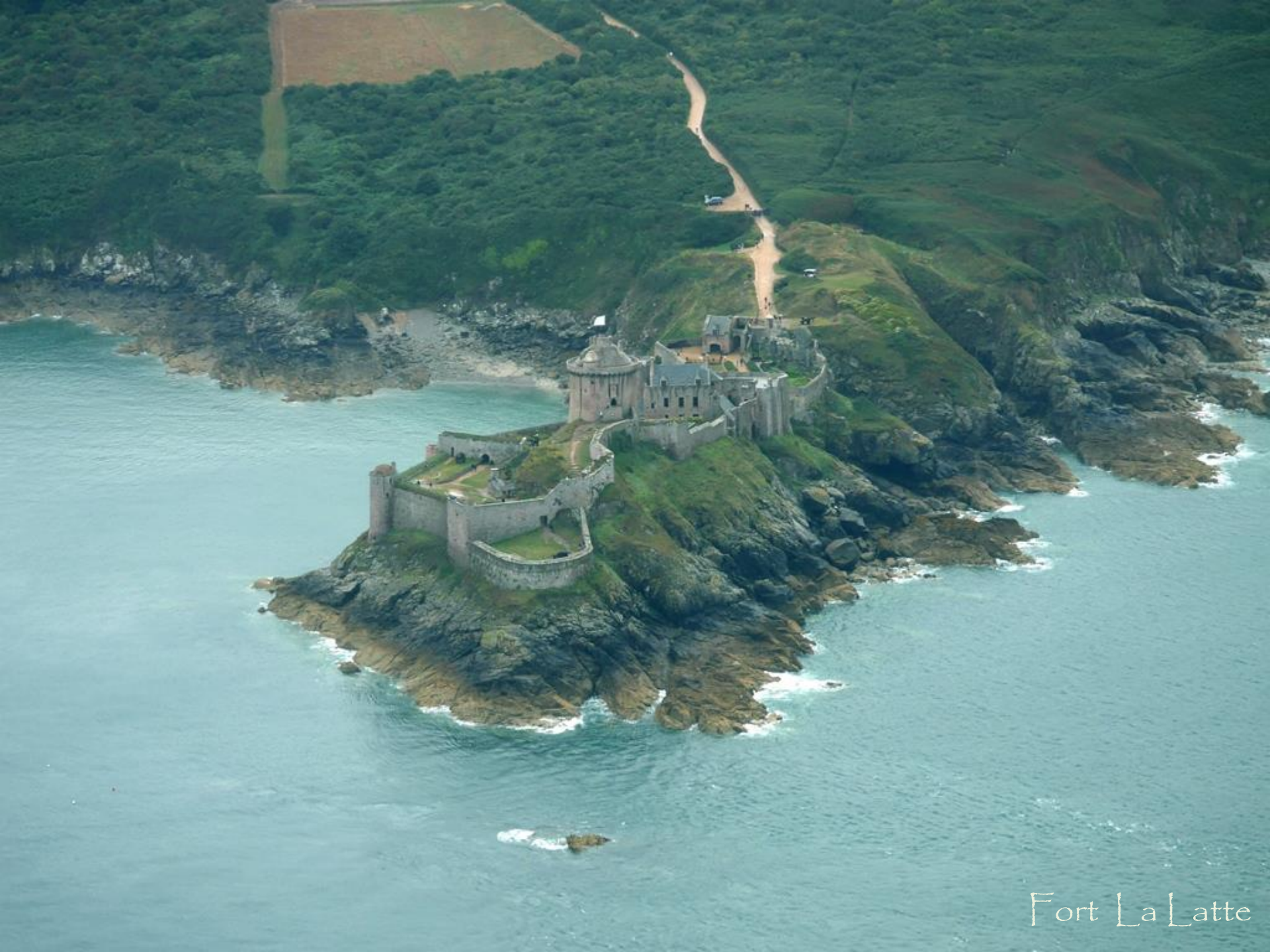
Fort La Latte