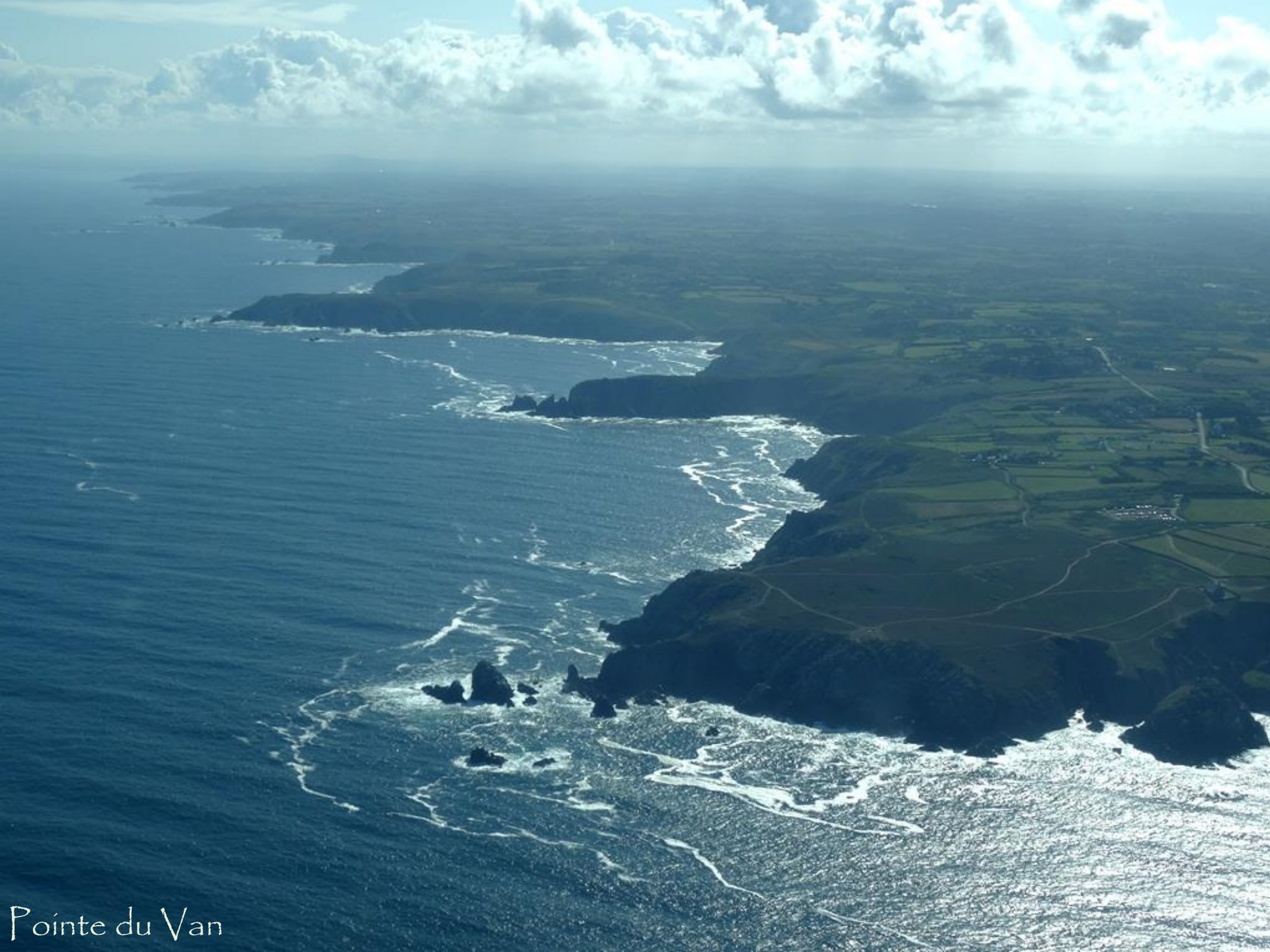
Pointe du Van