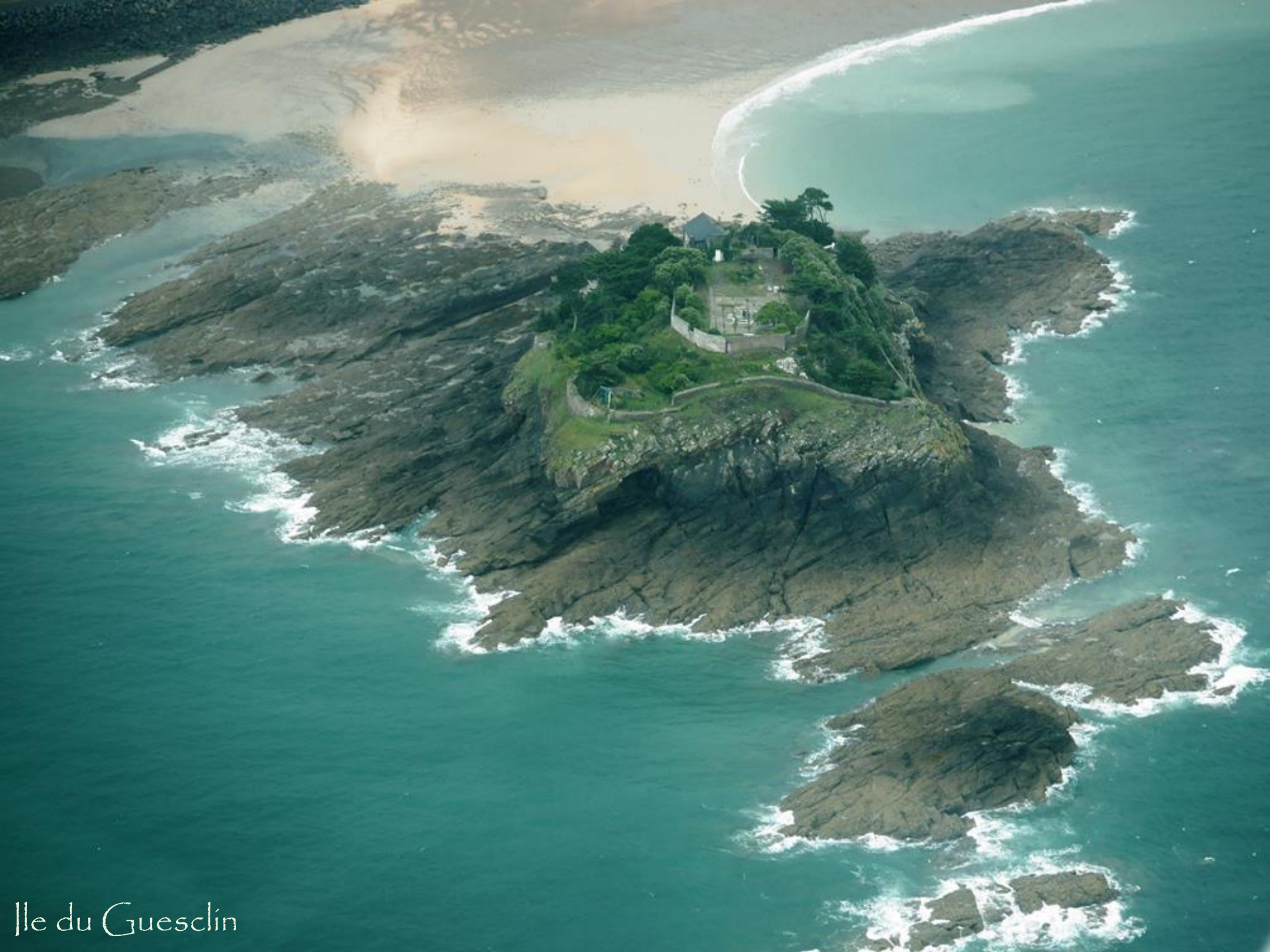
Ile du Guesclin