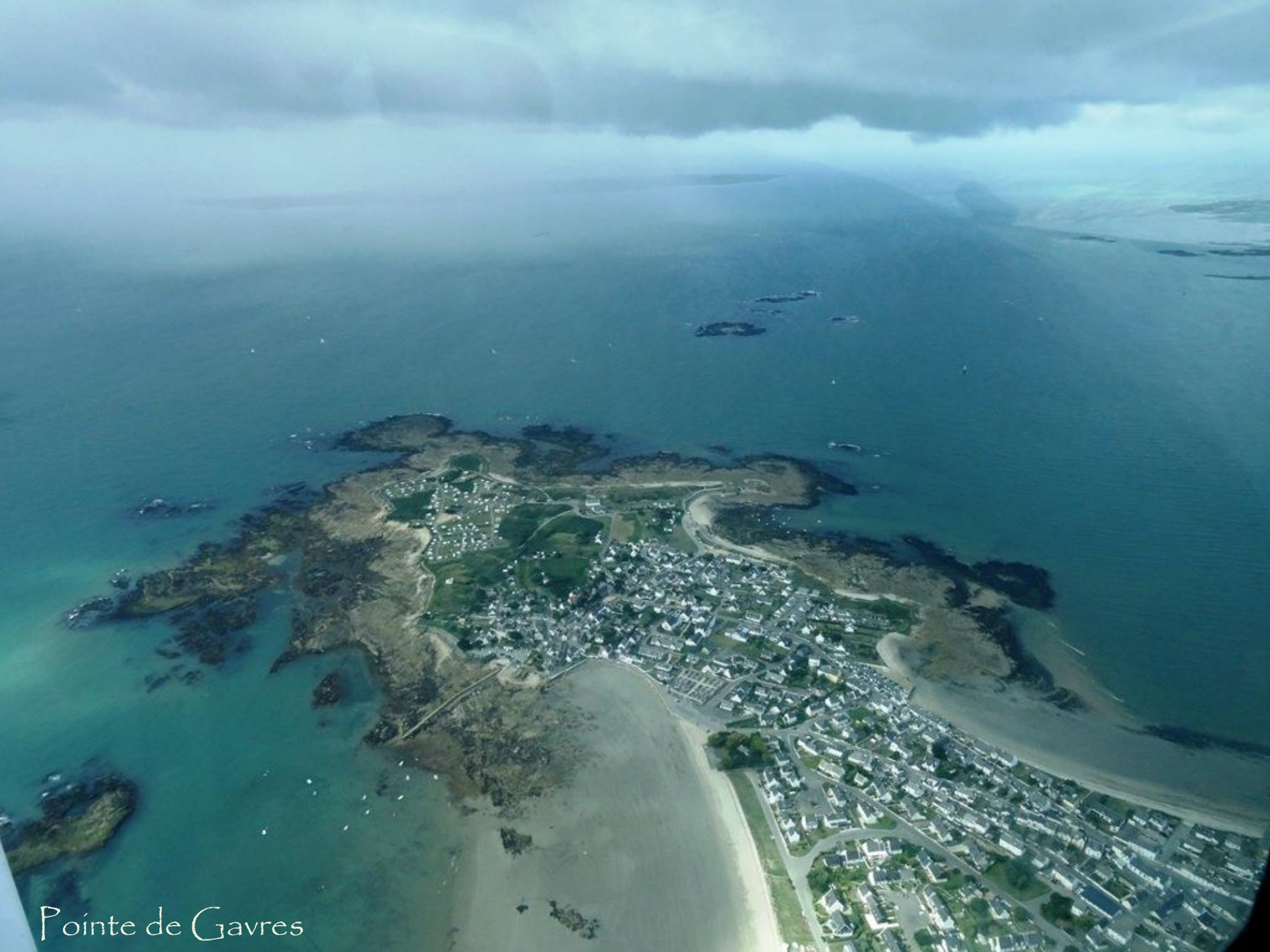
Pointe de Gavres