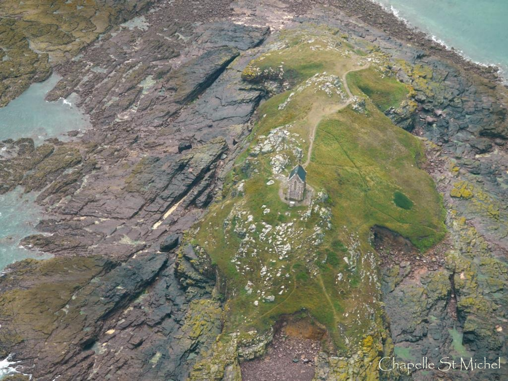
Chapelle St Michel