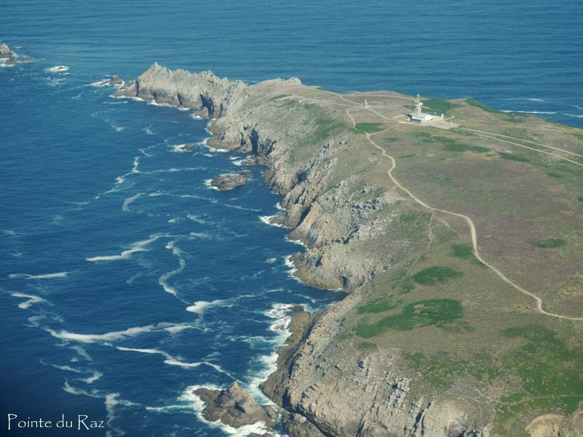
Pointe du Raz