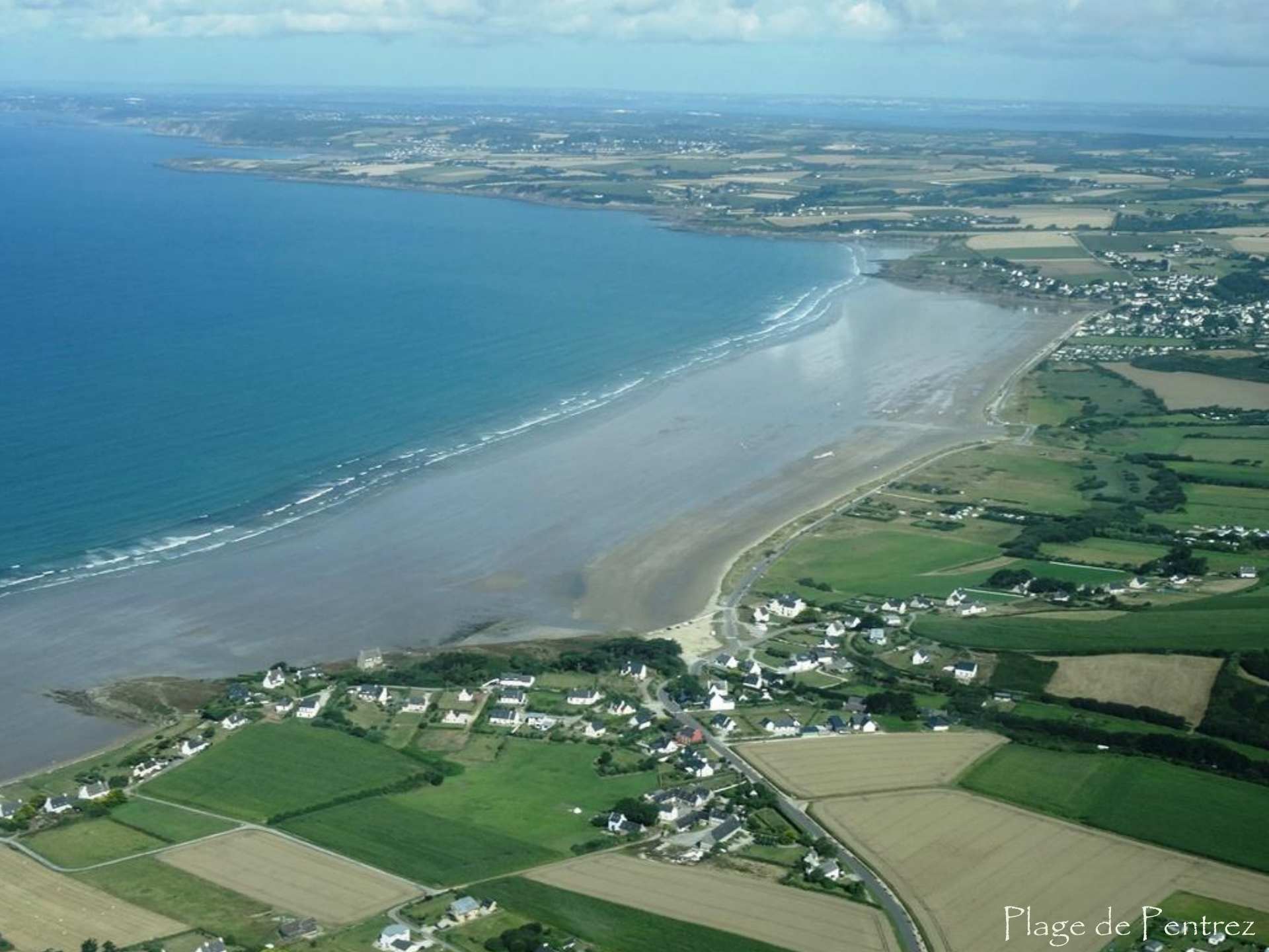
Plage de Pentrez