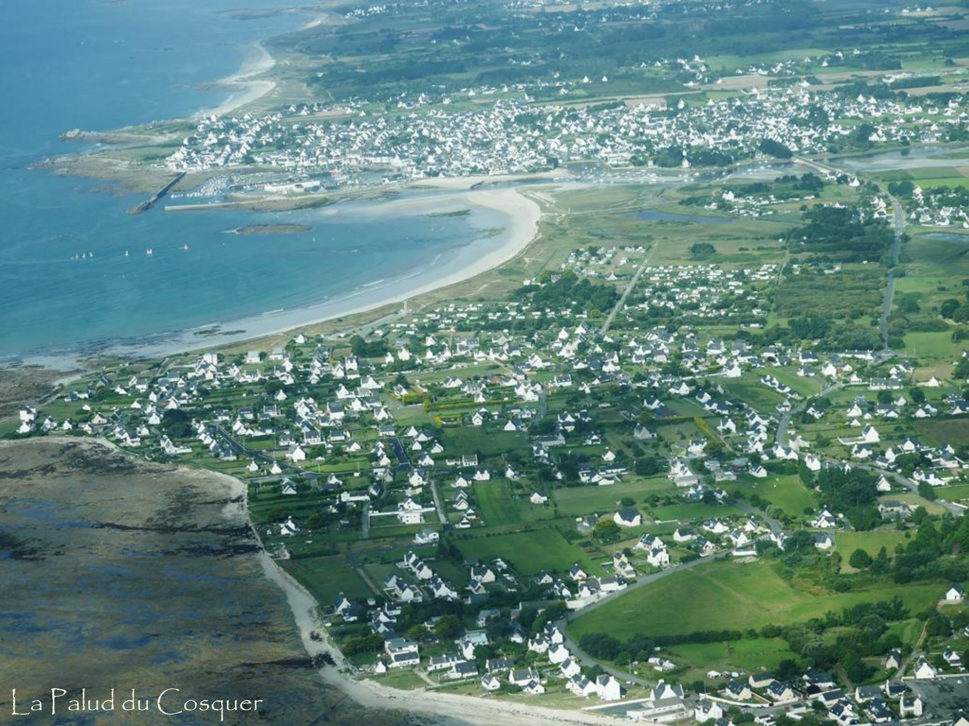
La Palud du Cosquer